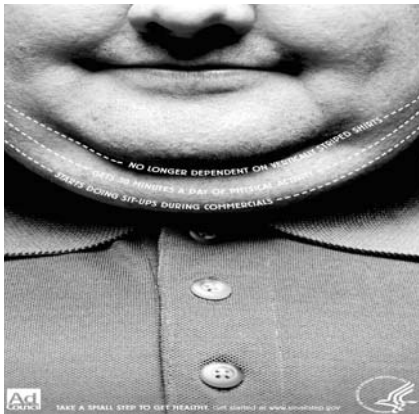
TAKE A SMALL STEP TO GET HEALTHY. Get started at www.aandp.com