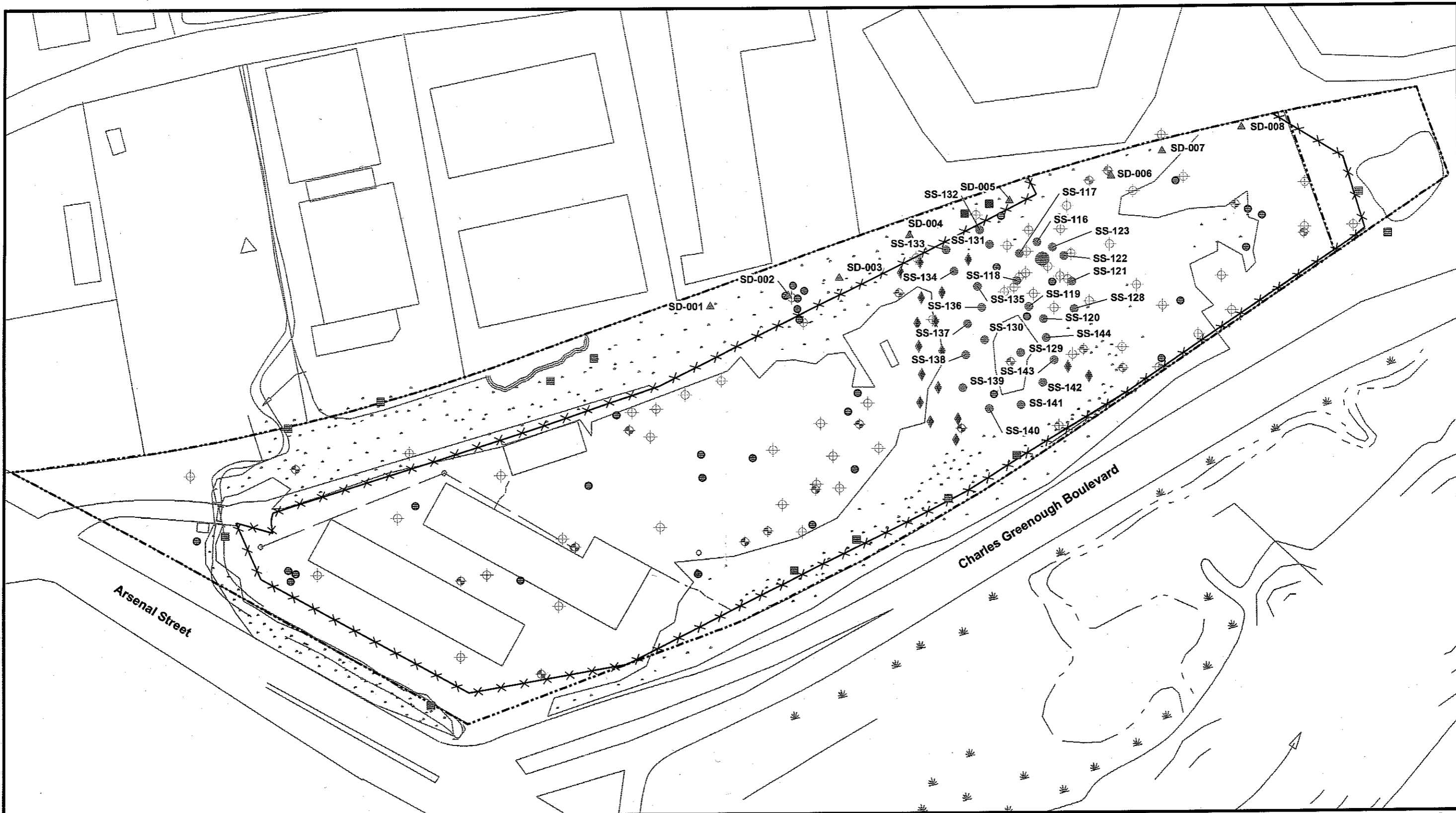
Figure 3 Sample Locations by MACTEC 2008 and Proposed Soil and Sediment Locations

Former Watertown Arsenal GSA Property Watertown, Massachusetts MACTEC, Inc.