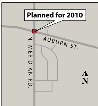
Auburn Street/ Meridian Road intersection

The Perryville/Swanson roundabout has been in use for more than a year, and motorists can expect to see more. Winnebago County Highway Department officials plan a roundabout next year for Auburn Street at Meridian Road; three others have no set construction date. Meanwhile, Rockford officials say the Auburn/North Main roundabout should be built in 2011.