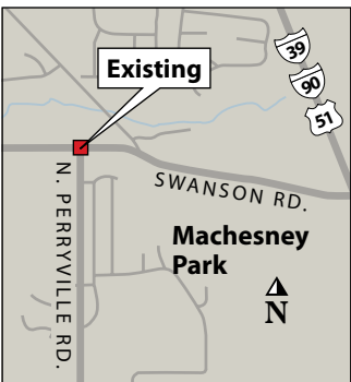
Perryville/Swanson roads intersection