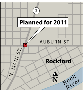
Auburn/North Main streets intersection